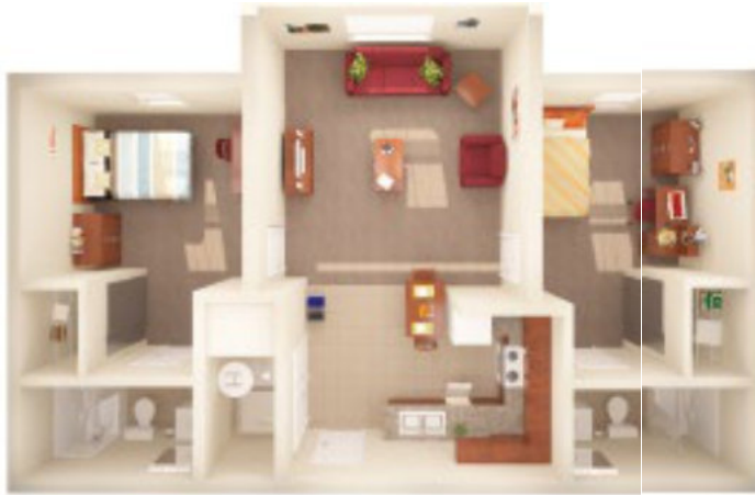
University Village –The Palm (2 bedroom, 2 bath) –other models are not pictured.

Each apartment is fully furnished and equipped with kitchen appliances such as refrigerator, stove, dishwasher, and microwave. A washer and dryer are also included in each apartment.