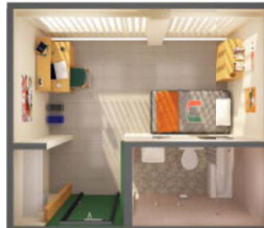
Suite style single