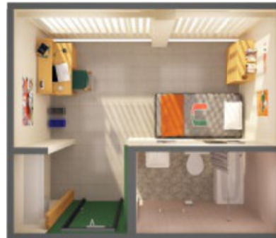
Suite style single